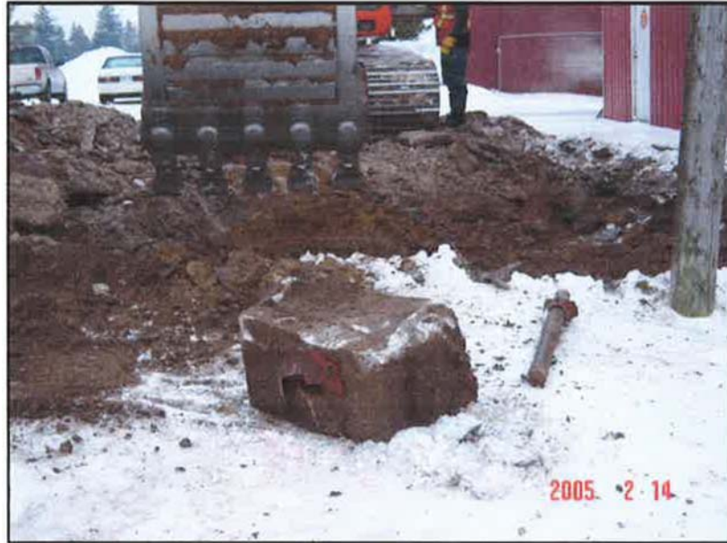
Photo 3 Concrete block and post uncovered at 1.2 mbgs