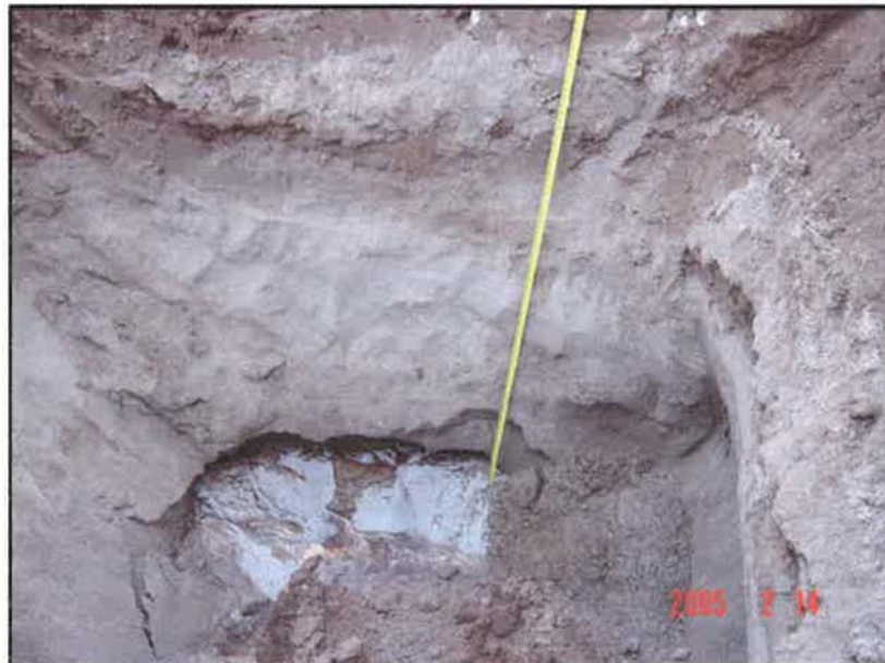
Photo 4 Northeast wall of excavation