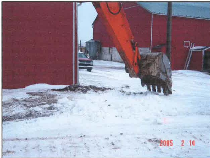
Photo 1 Location of former UST