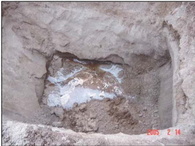
Photo 5 Bottom of excavation Water table intersected at 2.8 mbgs